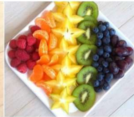
Fruit, Vegetables and Salad