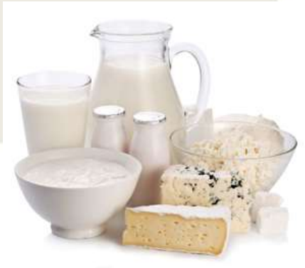
Dairy / Dairy Alternatives